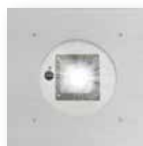
HELO F1 / F1-12 / F1-24

Helos can be integrated into your BACnet Building Automation System to enhance control and reporting and lower your total cost of ownership.